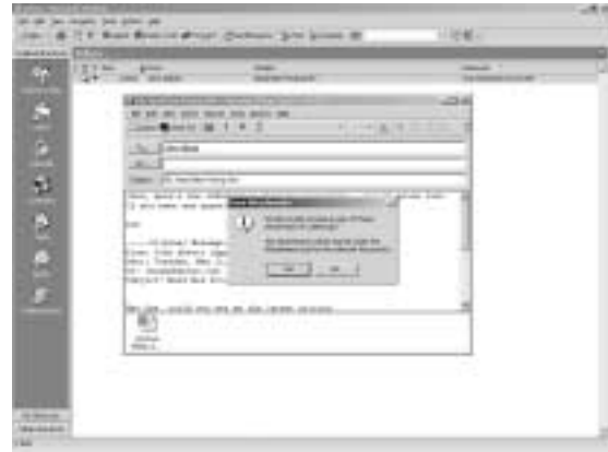
Keep track of Outlook e-mail attachments within relevant SalesLogix accounts.

your crowded Inbox—and give them the attention they deserve.