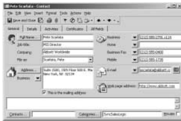
Move SalesLogix contacts into Outlook (and into the PDA of choice) with just one click.

and from Outlook, you won't need to worry about it. Your calendars and contacts will always be in sync. Of course, you can always sync on command with a simple menu selection.