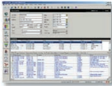
SalesLogix is organized and easy to use, putting everything your reps need to close the sale at their fingertips.