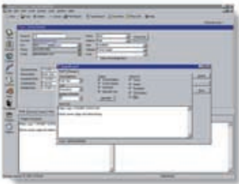
The SpeedSearch knowledge base consolidates your support resources for fast, easy retrieval.

And after your initial 30-day implementation, you can add more licenses or more functionality such as support. It's your call.